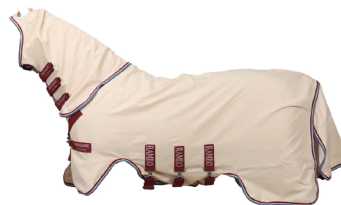
Rambo Sweet Itch Hoody Pony Fly Sheet From 100 cm