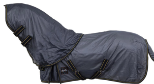
Combo First XS Fly Sheet From 70 cm