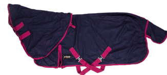
Epplejeck Junior Full Neck Fly Sheet From 70 cm

We also offer models tailored for the little ones, starting from EUR 50 cm!