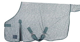
Harry's Horse STOUT! Teal Fly Sheet From 80 cm