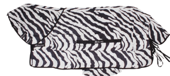
Bucas Sweet Itch Zebra Junior Fly Sheet From 85 cm